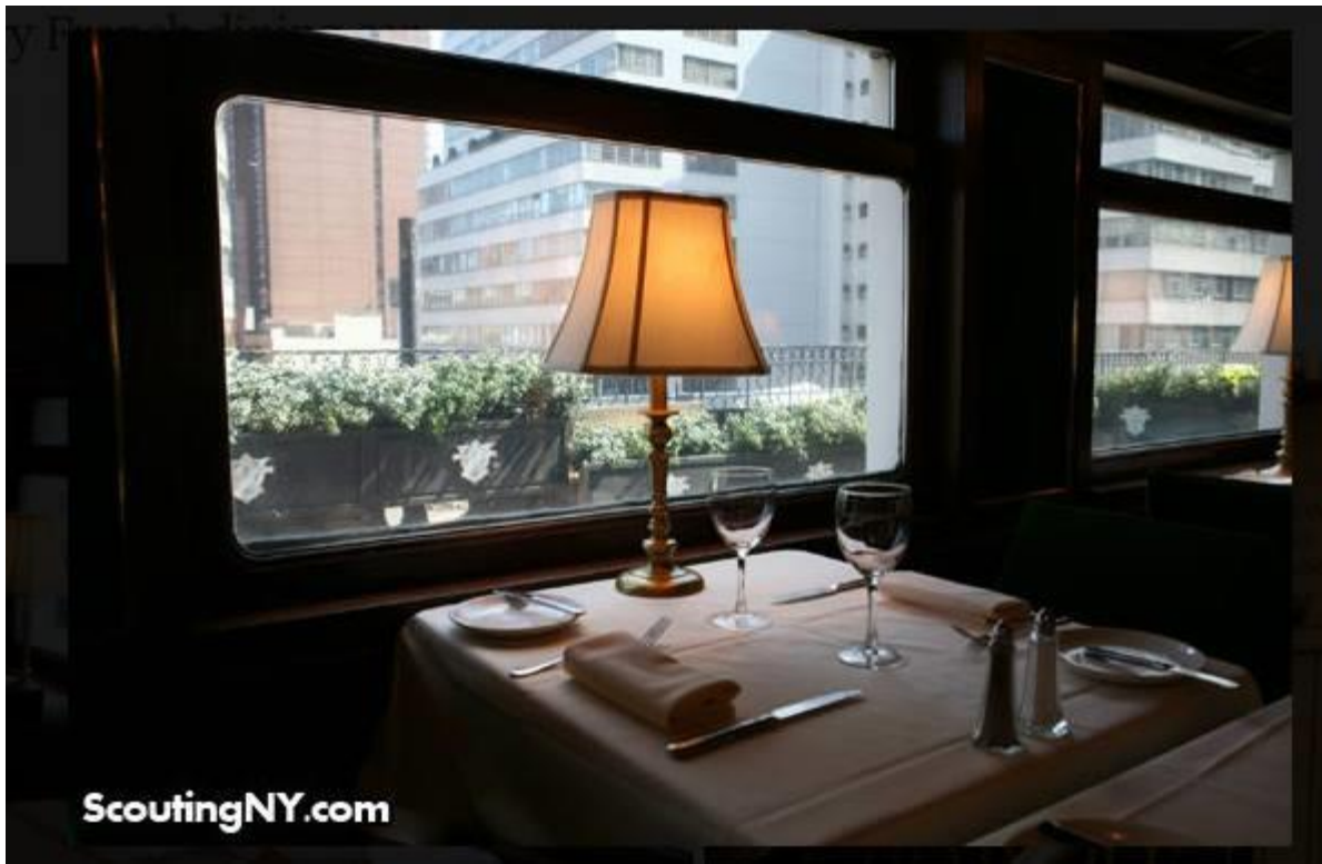
Originally the view was of the East River. Now buildings have blocked that