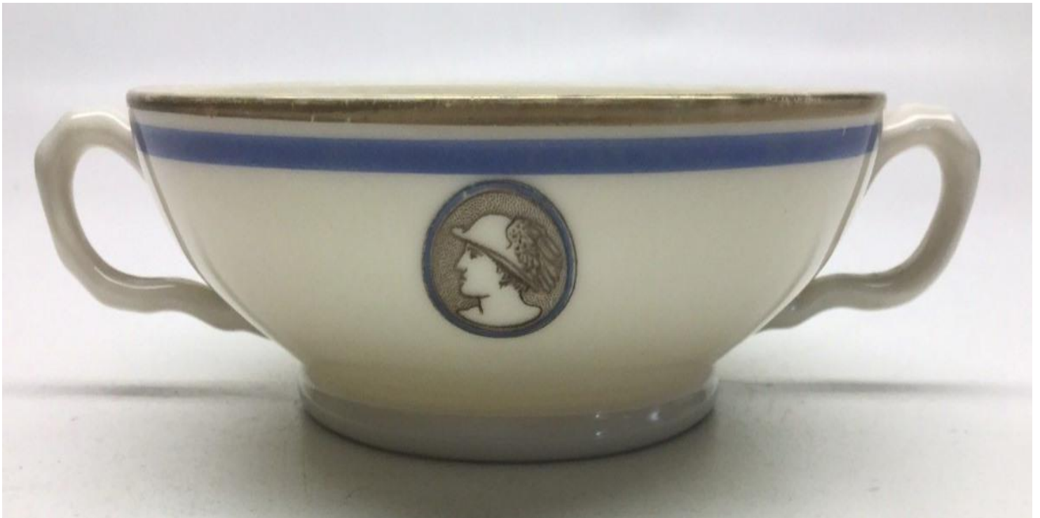
Handled bullion cup