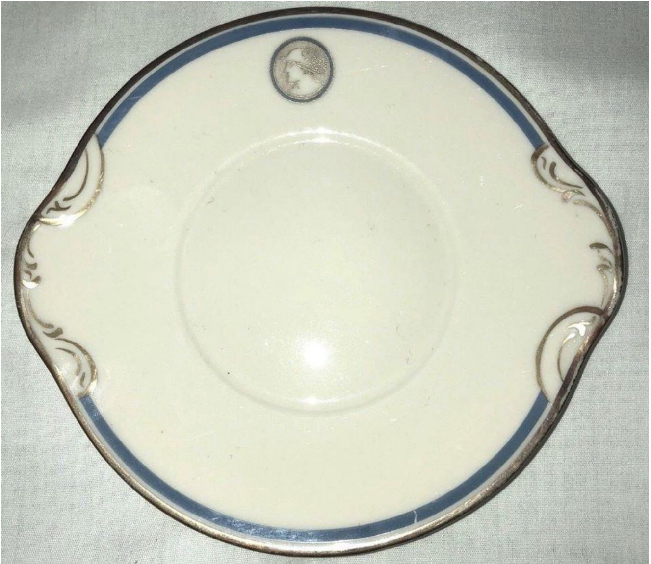
7-inch handled plate