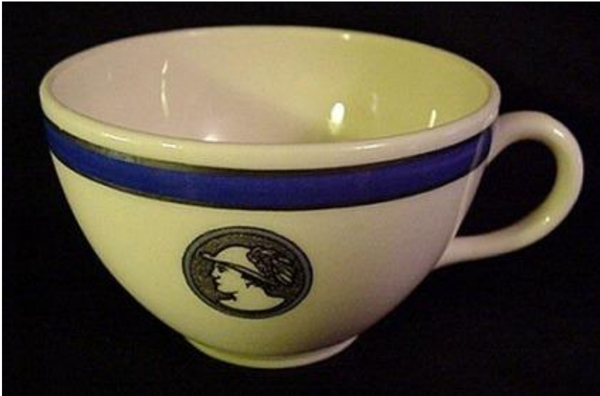
Cup with platinum lines flanking the blue stripe