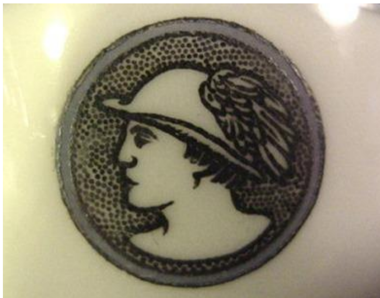
Overglaze circle logo