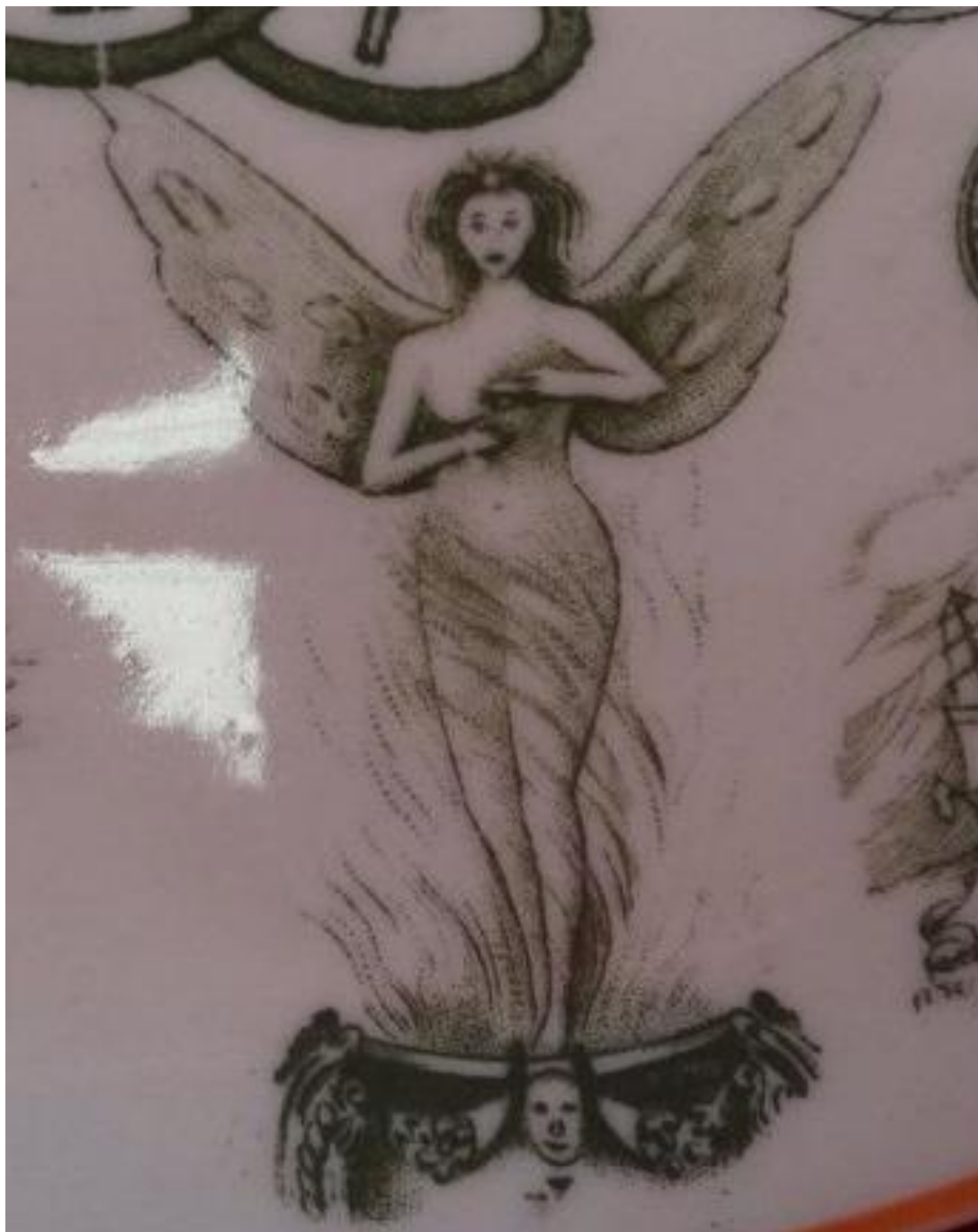
Winged lady on 1915 Syracuse sample plate