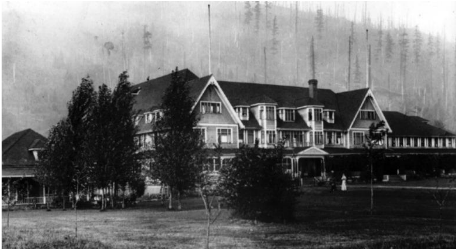
View of the Sanitarium