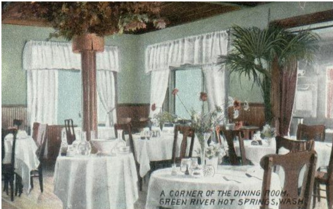
View of a portion of the dining room