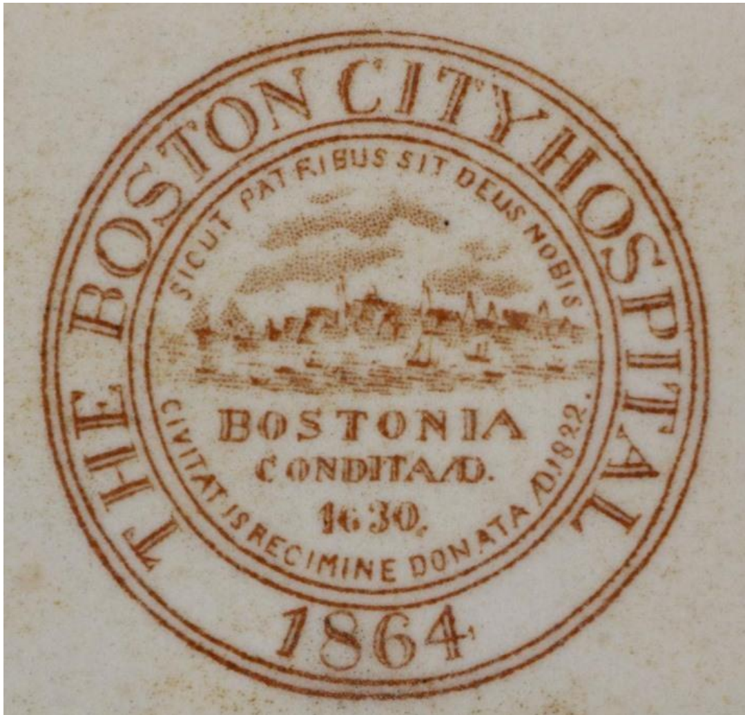
Circular crest in center of well