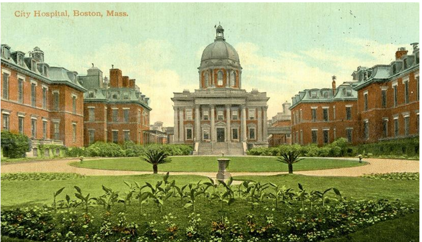
Postcard view, showing more additions to the rear