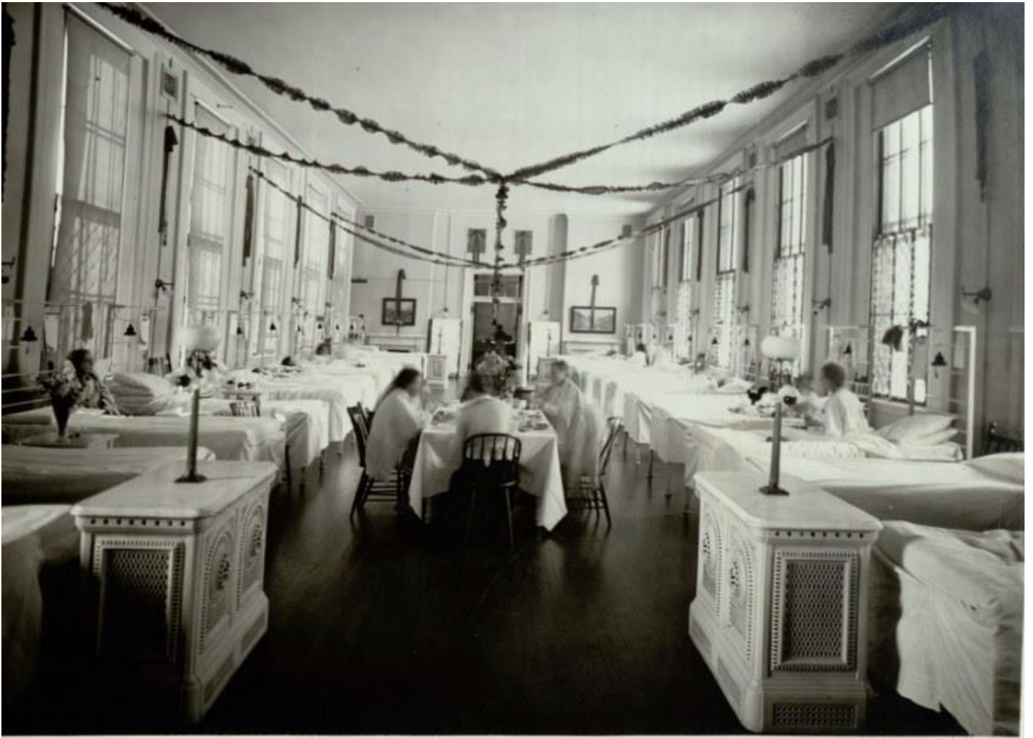
The Boston City Hospital Christmas 1912 Ward G.