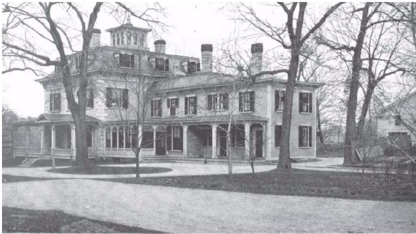
CONVALESCENT HOME. 1890.