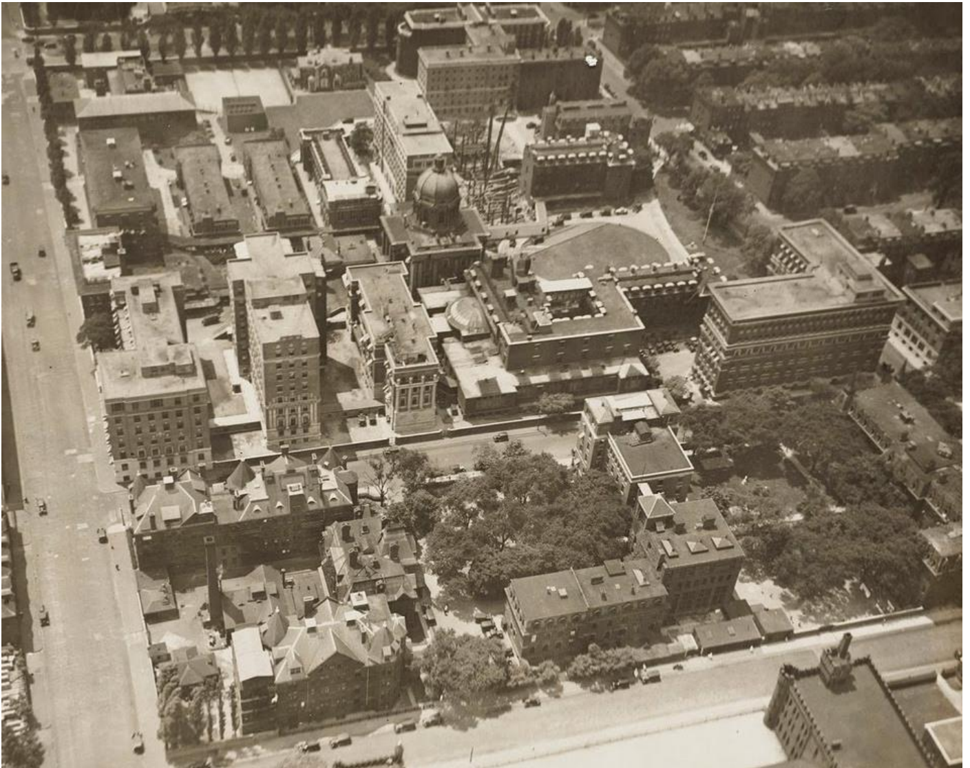
1929 aerial view