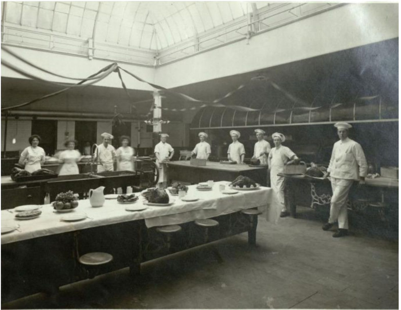
The Boston City Hospital Christmas 1912 Kitchen.