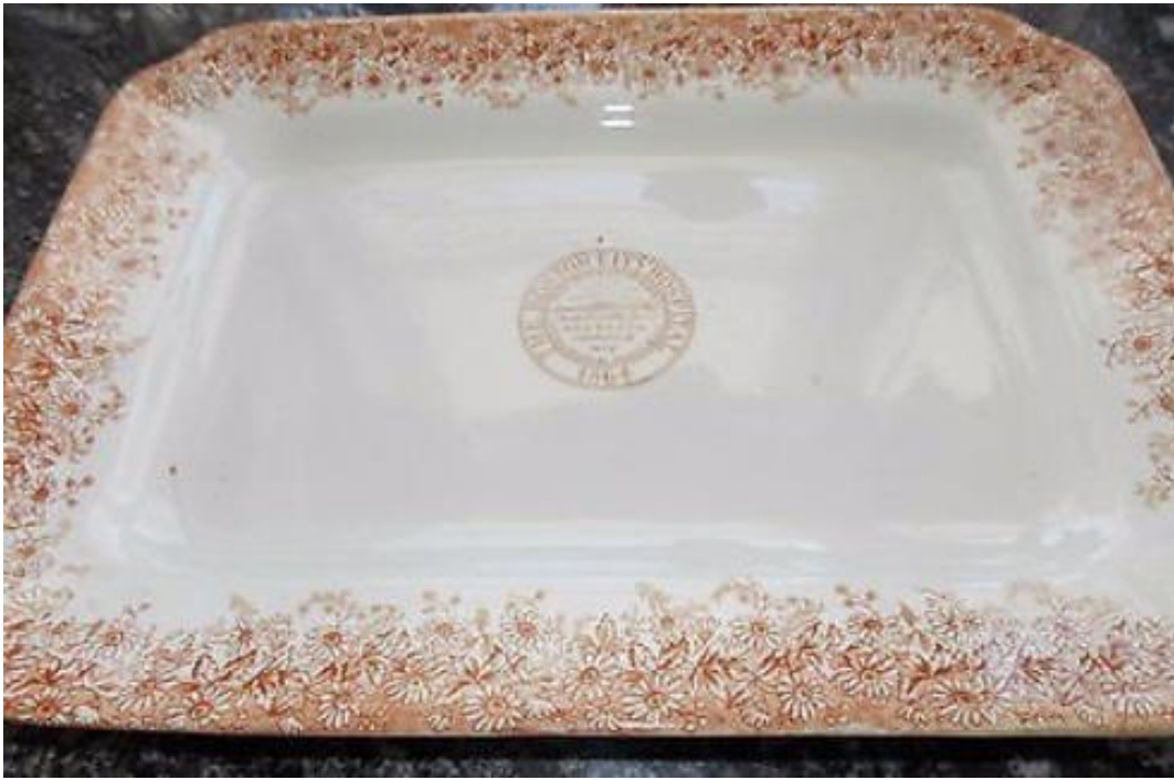
4" x 10 1/2" rectangular serving platter