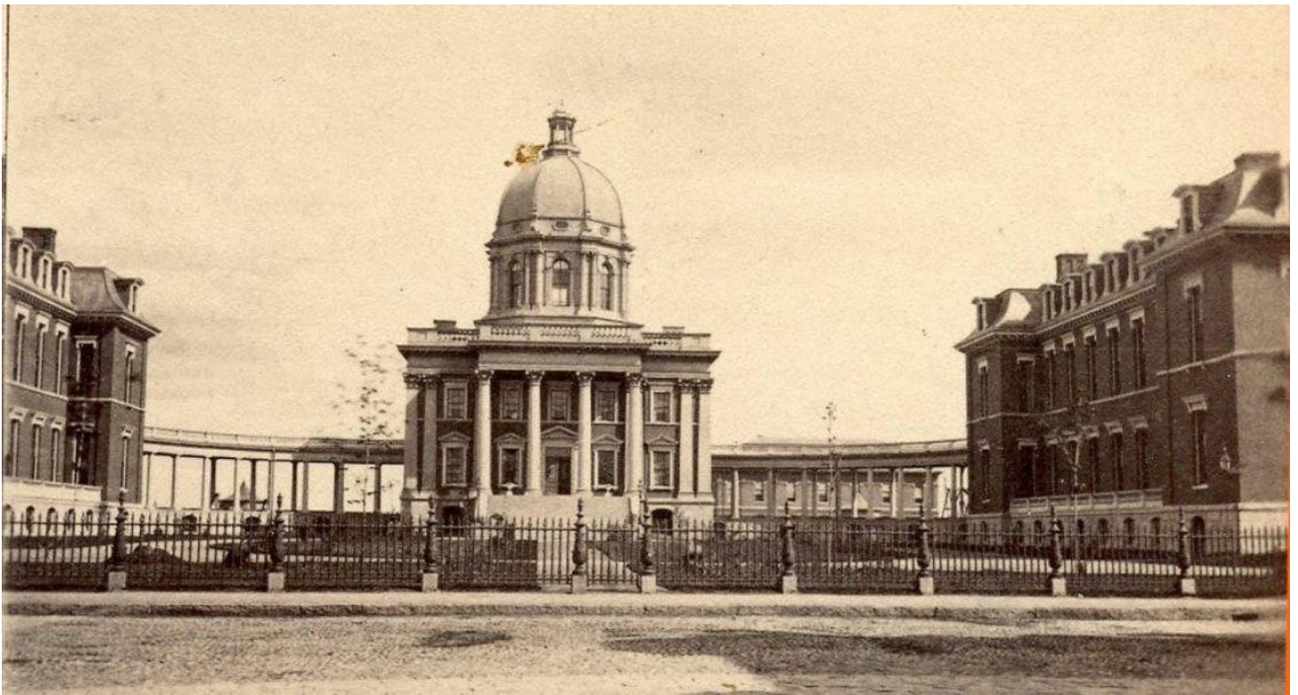
Early view of 1864 building with flanking additions