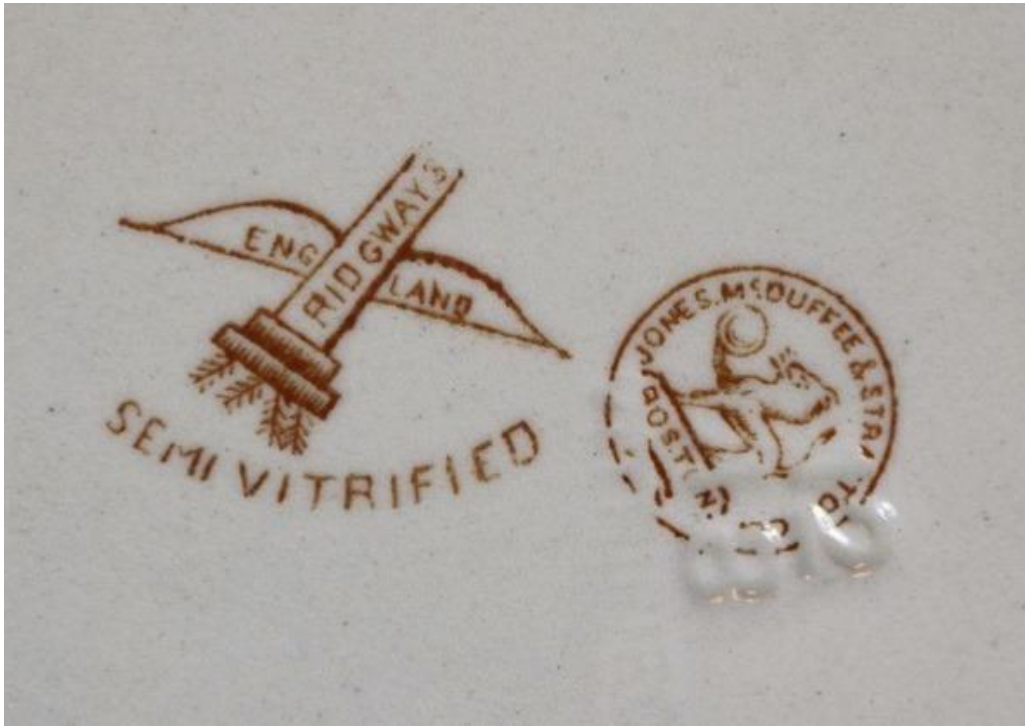
Ridgway's and Jones, McDuffee & Stratton backstamps