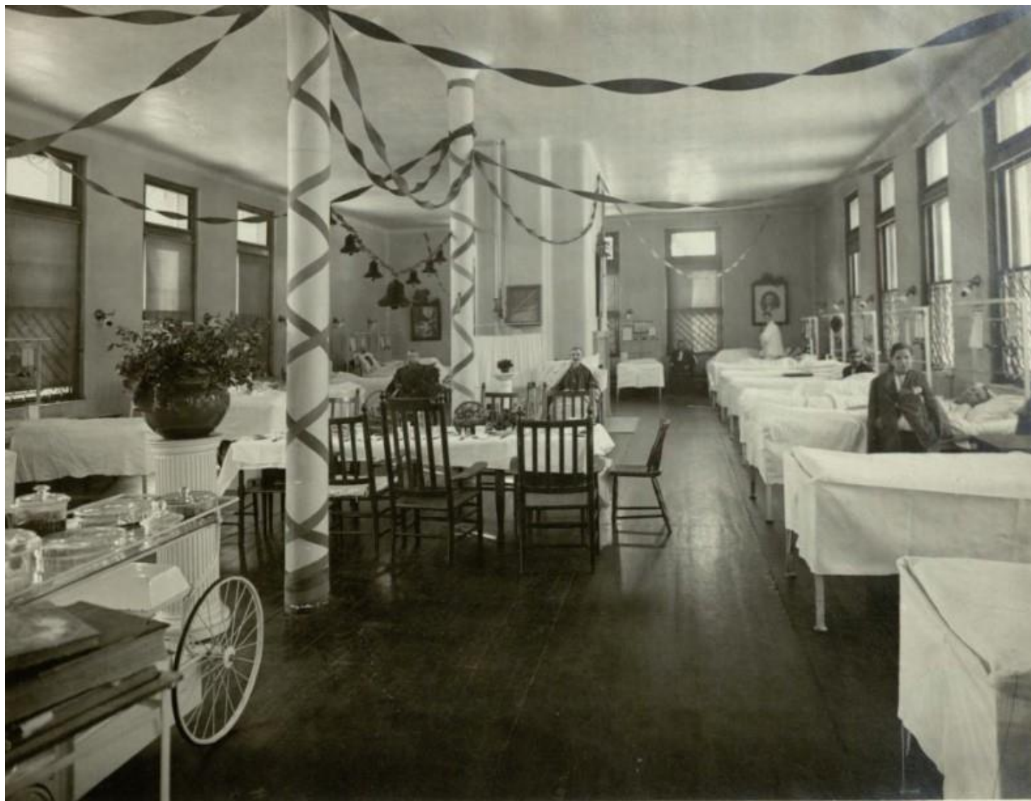
The Boston City Hospital Christmas 1912 Ward W.