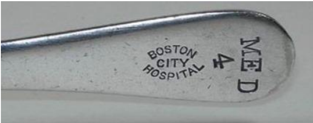
Crested silver flatware