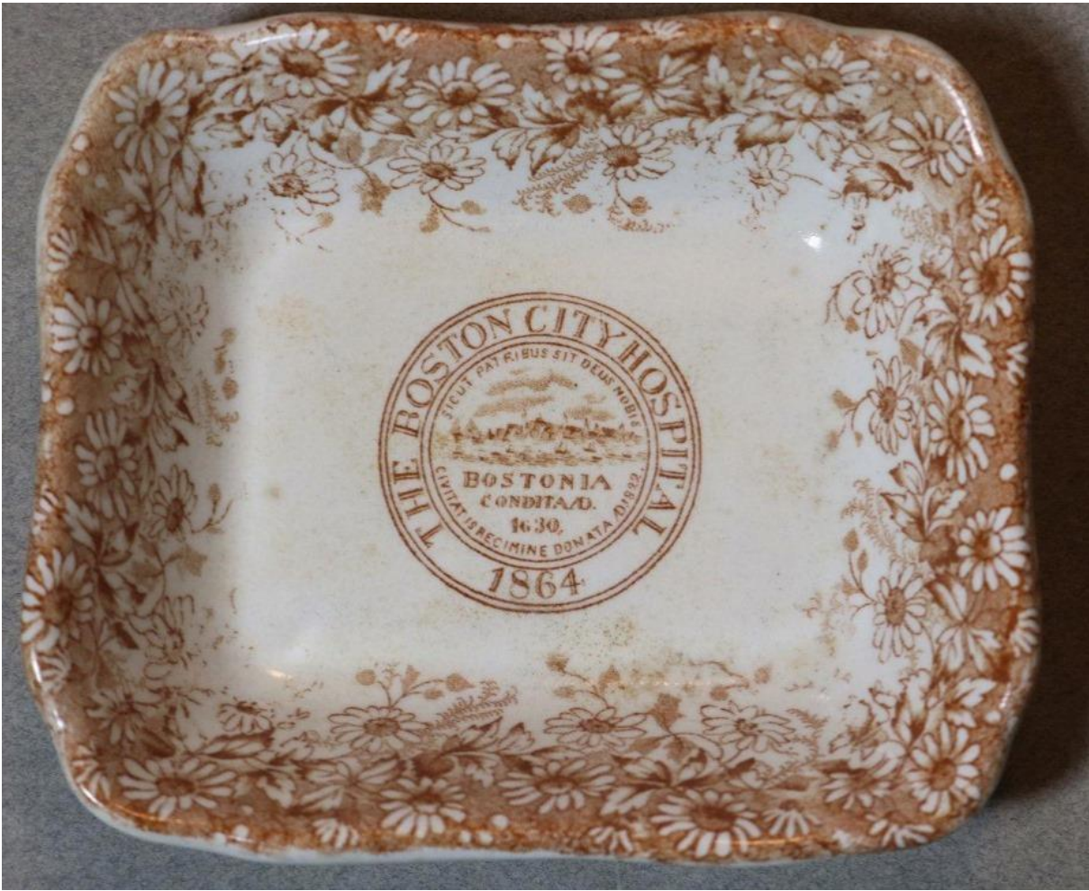
4 7/16" x 3 3/4" rectangular bowl