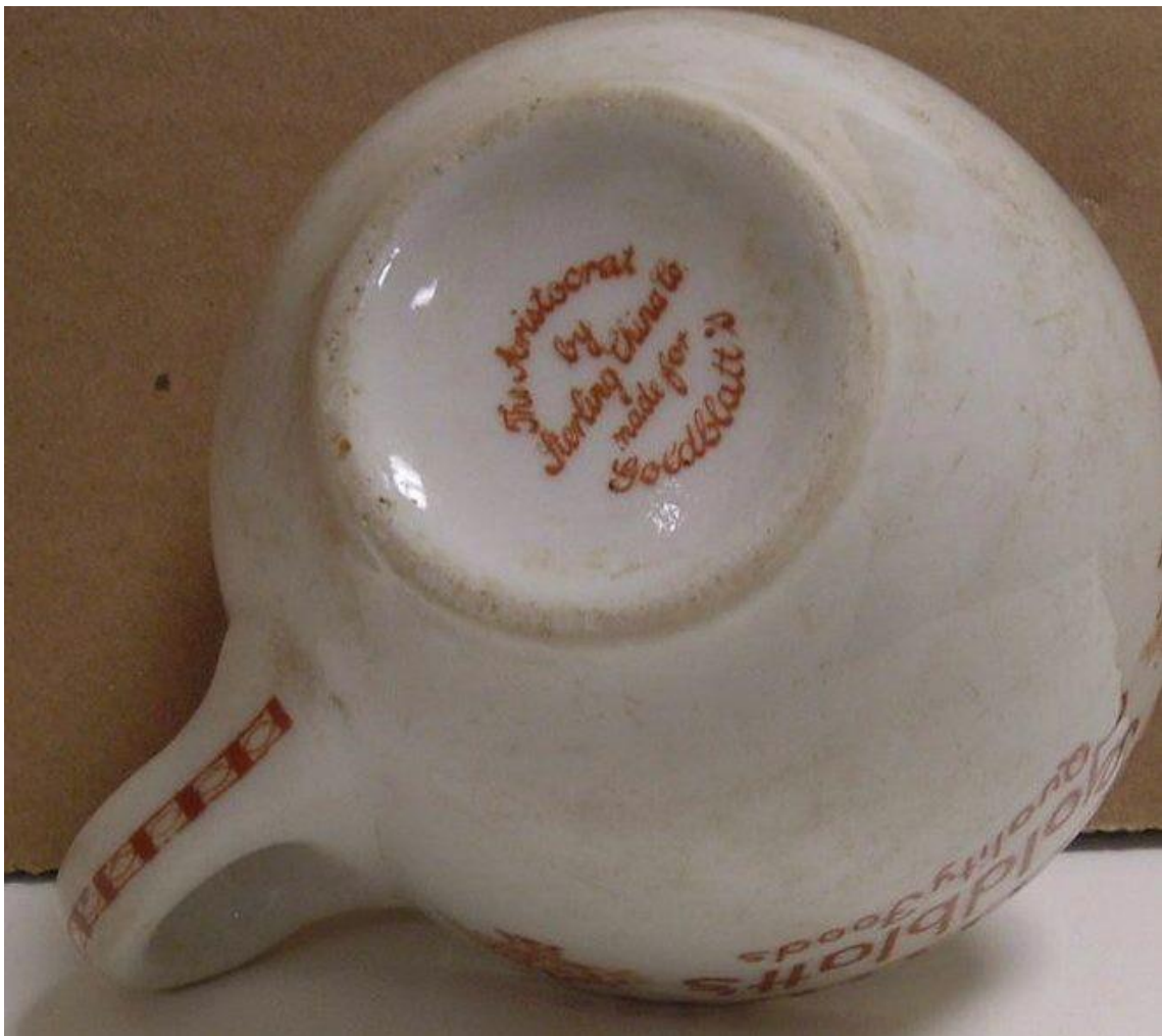
Backstamp: The Aristocrat by Sterling China made for Goldblatt's