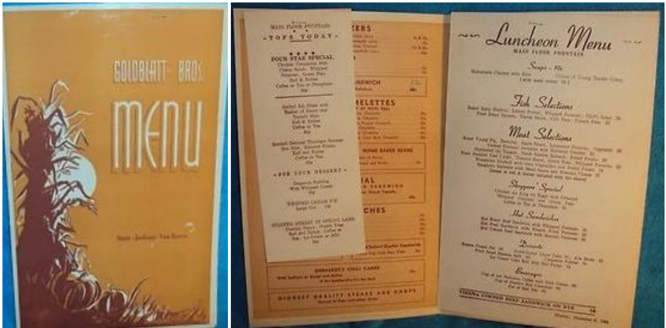
Goldblatt Bros. luncheon menu