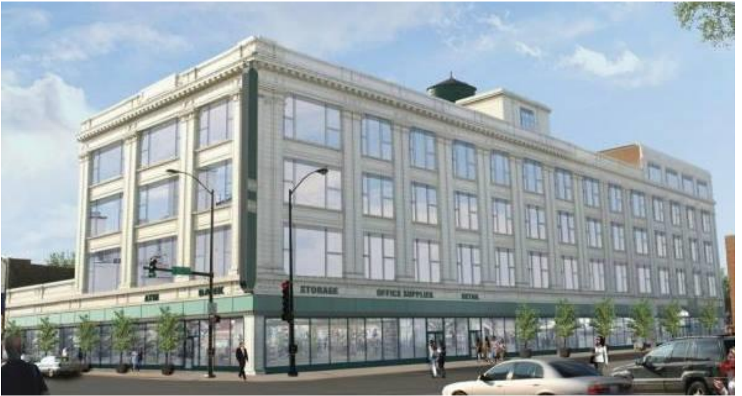
612. Rothschild & Company's New Building, Chicago.