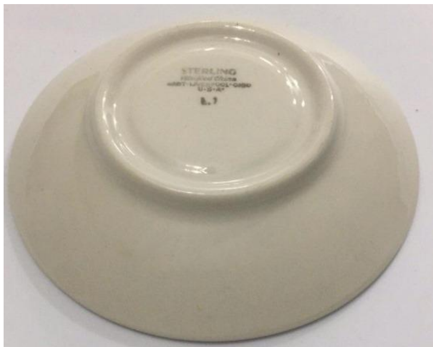
Backstamp on Sterling China saucer