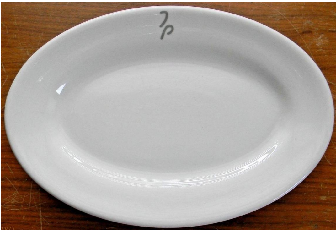
Skyline Dining Room “tp” crested platter, by Shenango