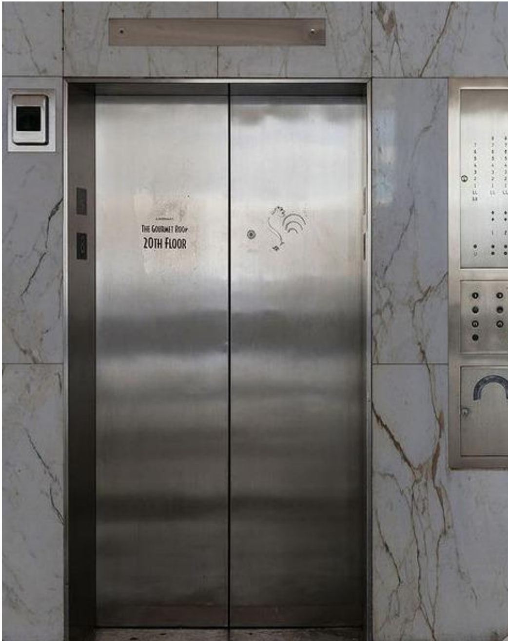
Elevator door with the rooster logo