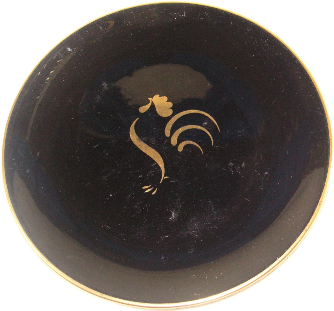
The Scammell coupe-shape 10 1/2" service plate with coin gold logo