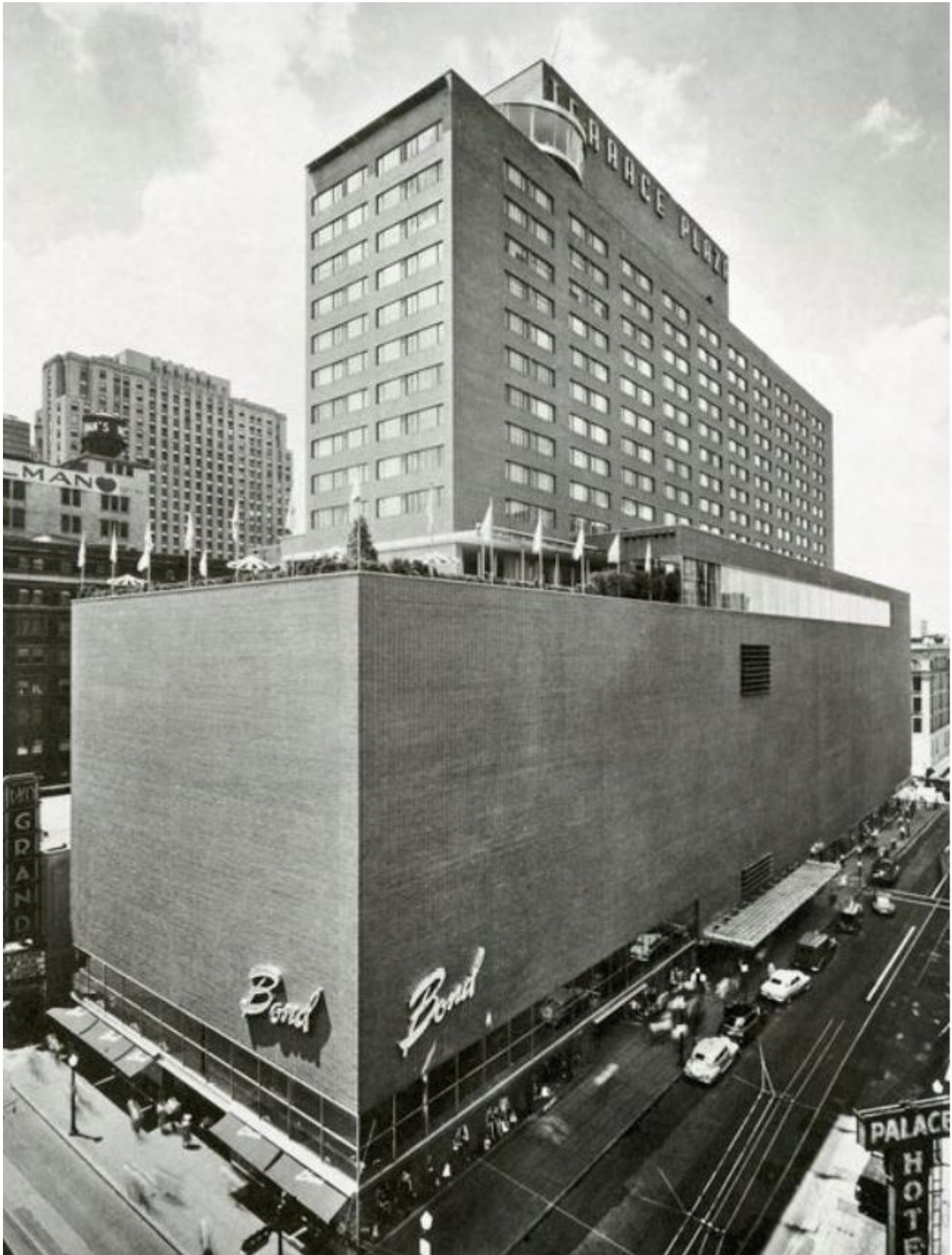
Terrace Hotel exterior