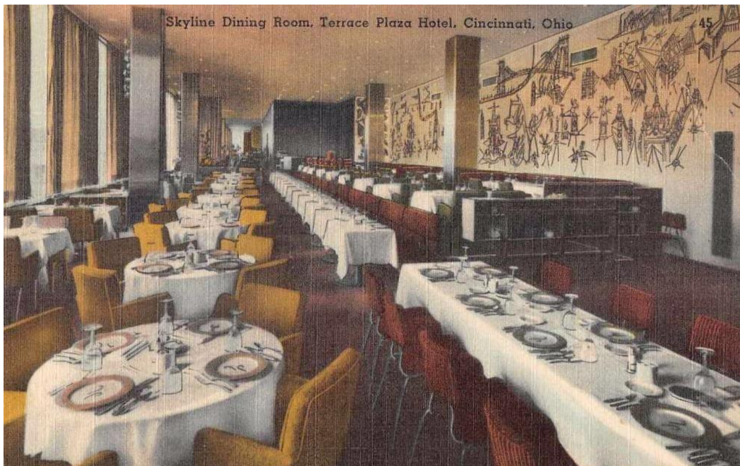
Postcard view of Skyline Dining Room with service plates