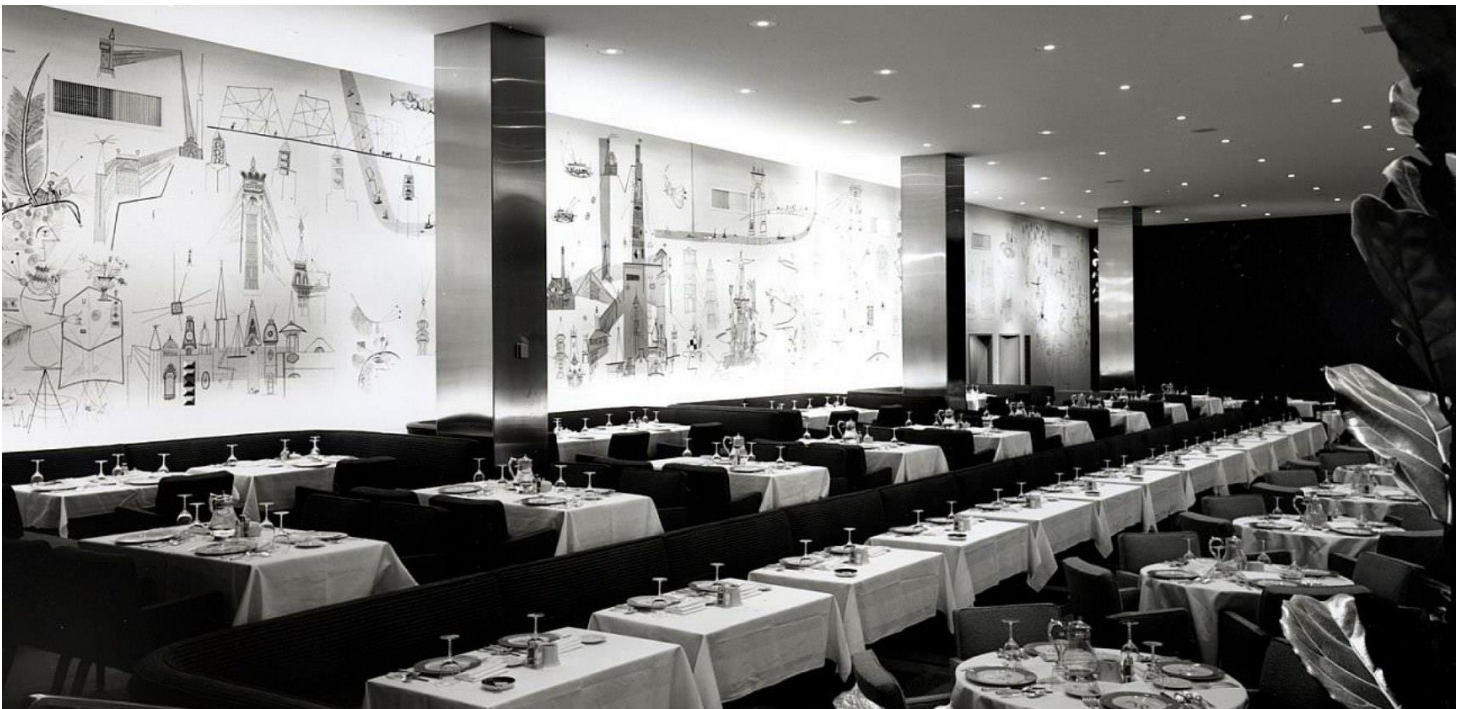
Skyline Dining Room with ashtrays (see IDwiki) and sugar bowls