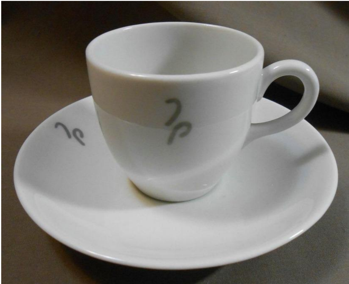
Skyline Dining Room “tp” crested cup and saucer, by Shenango