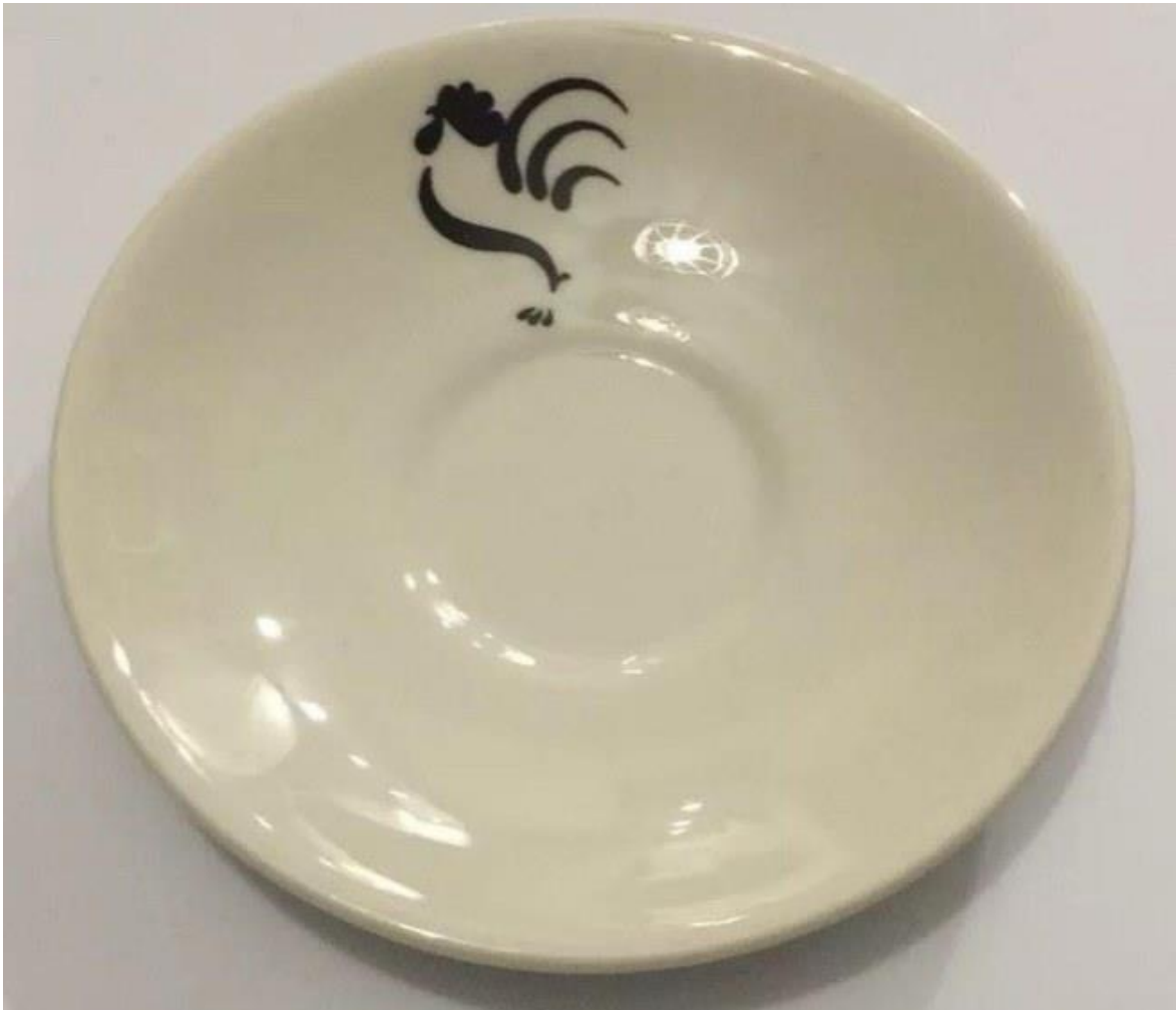
Saucer by Sterling China with rooster logo