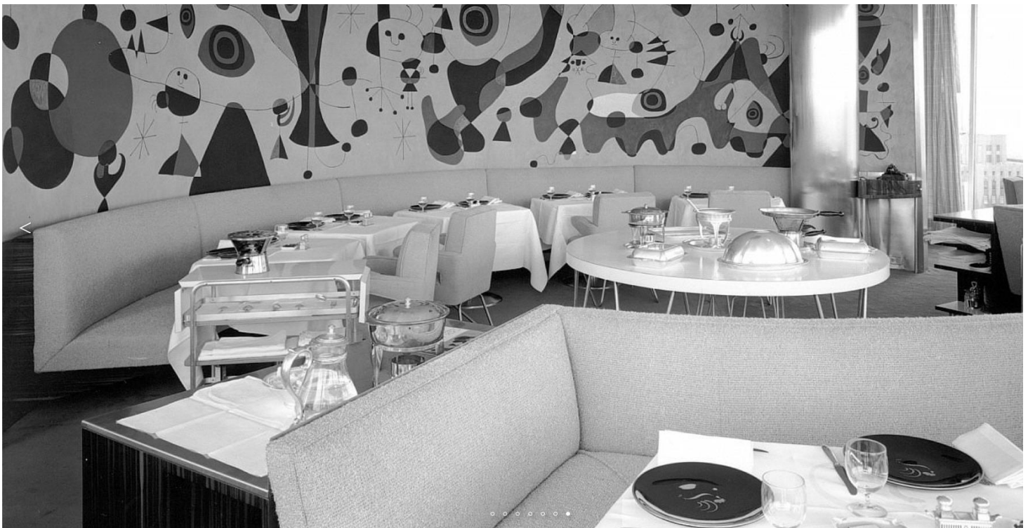
View with service plates on table with rooster logo visible