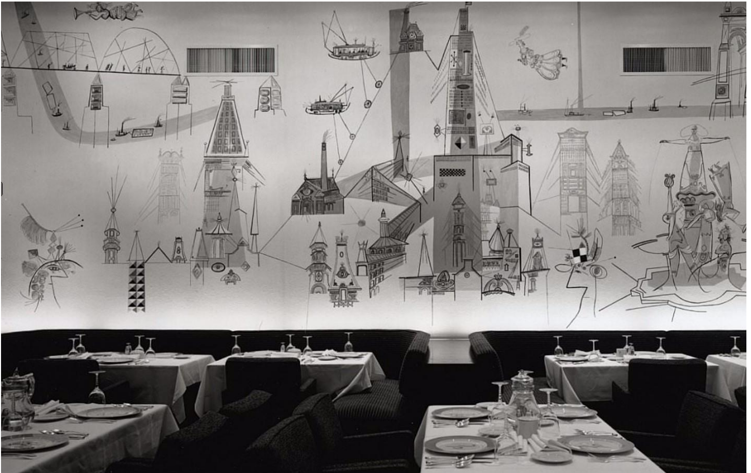
Skyline Dining Room wall mural by Saul Steinberg, with service plates on tables