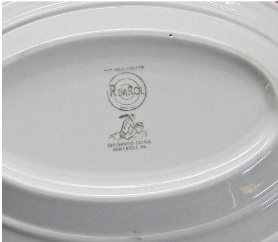
Backstamp on Shenango platter