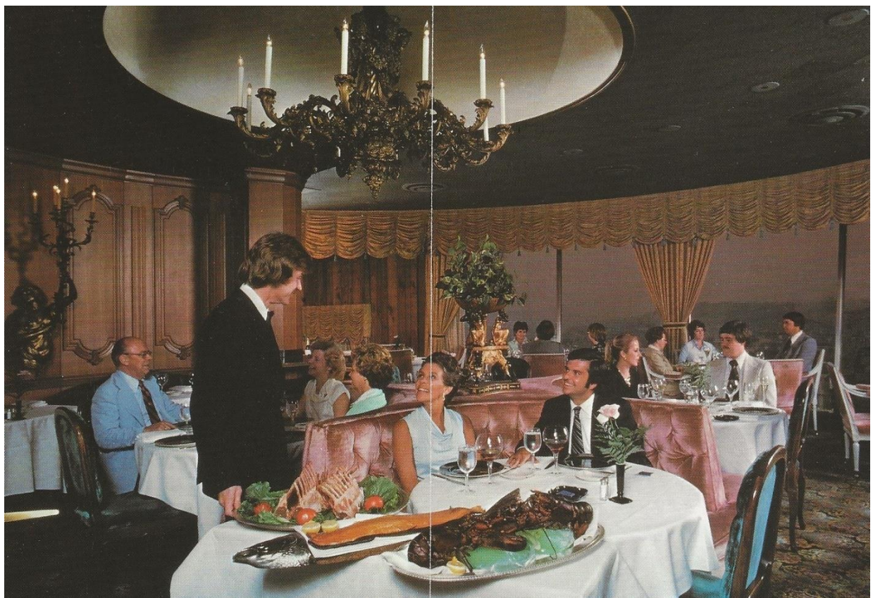
1977 view of renovated Gourmet Restaurant with flat rim black service plates