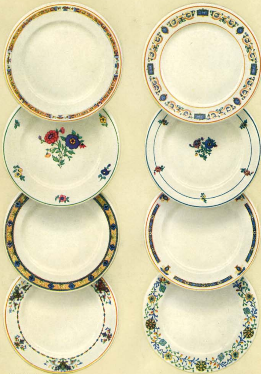
B. U.-3 Regent D. C. 1001 B. U.-14 Egyptian D. O.-17 Ornamental