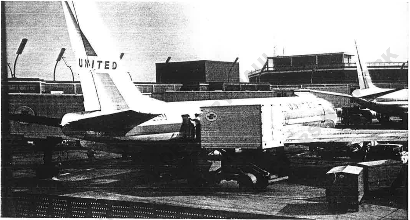
As the United Air Lines jet completes loading passengers, baggage and fuel, the food truck drives up. Buffets with meals ready for serving are transferred to the plane's galley.

The meteoric development of aviation has taken place in the 20th Century—the century when technology "came into its own" and progressed faster than at any other period since the beginning of time.