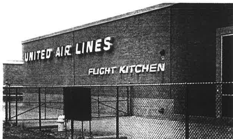
The United Air Lines Flight Kitchen at Chicago's O'Hare Field is the largest flight kitchen in the country. It prepares food for Red Carpet, regular first class, and coach travelers 24 hours a day, 7 days a week, every day in the year.