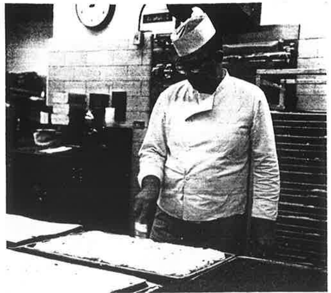
Pans full of rich "goodies" are only part of the huge quantity of food that is baked fresh each day, and served to hungry travelers high in the sky.