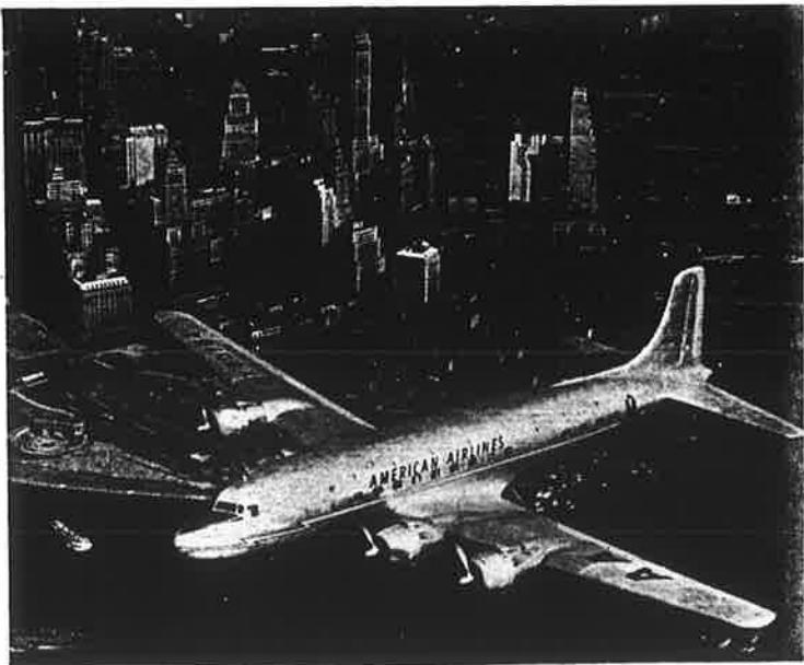
Vehicle for "flying china," the giant, four engine DC-6 Flagship, first of American Airlines' post-war domestic fleet of 150 planes.

The making of Syracuse China is a skilled and exacting job. Each step in the process requires special training and not a little experience. Thus, day in and day out, a Potter is very involved in his own particular operation with justifiable pride in his contribution to the finished product. But since ware is made to be used, let us follow the finished product through the shipping room door and see for ourselves, our own handi-work, Syracuse China in Service.