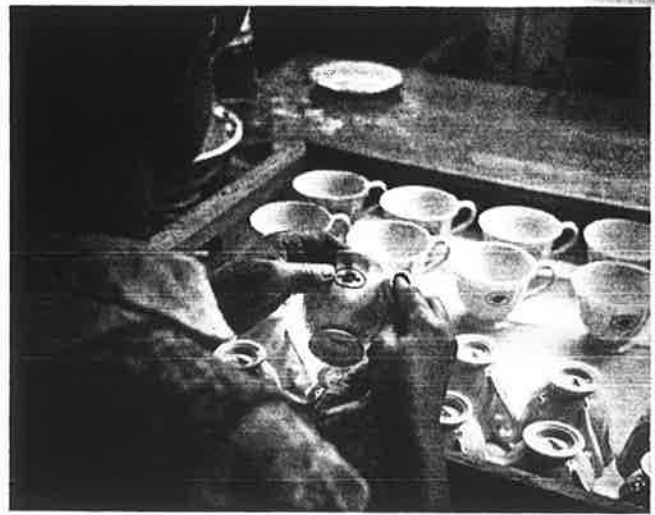
Every item used by United Air Lines is decorated with a gold edge line and their own symbol, also in gold. All the crests are hand applied, as Fayette decorator Mary Sienkiewicz demonstrates.

with last minute switches in departure time or type of plane is a difficult and, at times, frenzied task. United Air Lines operates 15 flight kitchens throughout the country, and has meals prepared by caterers in 60 other cities. Their food service operation, considered separately from all other parts of the airline's operation, is a $52 million a year business. It is currently listed by Institutions , trade magazine of the food service industry, as the 38th largest food service operation in the country. Some of those listed as larger than United Air Lines are the United States Army, Navy, and the New York City public school system!