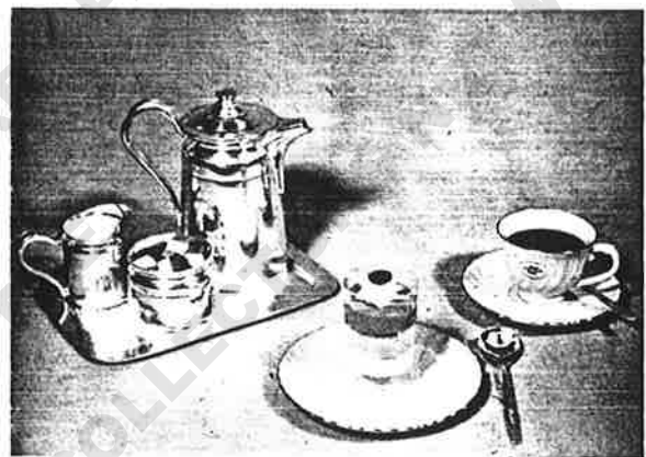
United Air Lines guests find all the details of elegant dining provided by Red Carpet service high above the earth's surface.