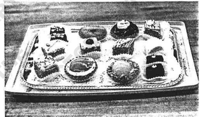
This tray of dainty French pastries is an example of the fine dining offered on the Red Carpet flights.