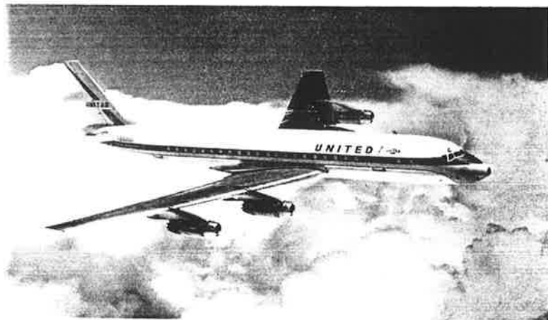
Syracuse China finds its way aboard planes like this United Air Lines jet every day. This one is a Douglas DC-8.

No matter how much man learns about controlling his surroundings and his life, the chances are that china will still have a job to do. It has remained a basic item for thousands of years, adapting to new situations as the need arose. Syracuse China has been a leader in writing the latest chapter, and many projects underway right now point to new achievements in the future.