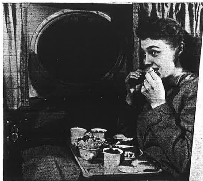
Nothing wrong with this chicken! . . . says Patricia Neal, currently appearing in the Broadway hit "Another Part of the Forest." Miss Neal is enjoying a drumstick informally aboard an American Airlines Flag

And does that food look good on Syracuse China!