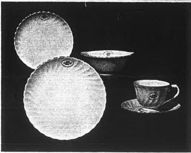
Fine Silhouette shape Syracuse China dinnerware was selected by United Air Lines to provide the right atmosphere for their luxurious Red Carpet service. United has provided this VIP service since 1965.